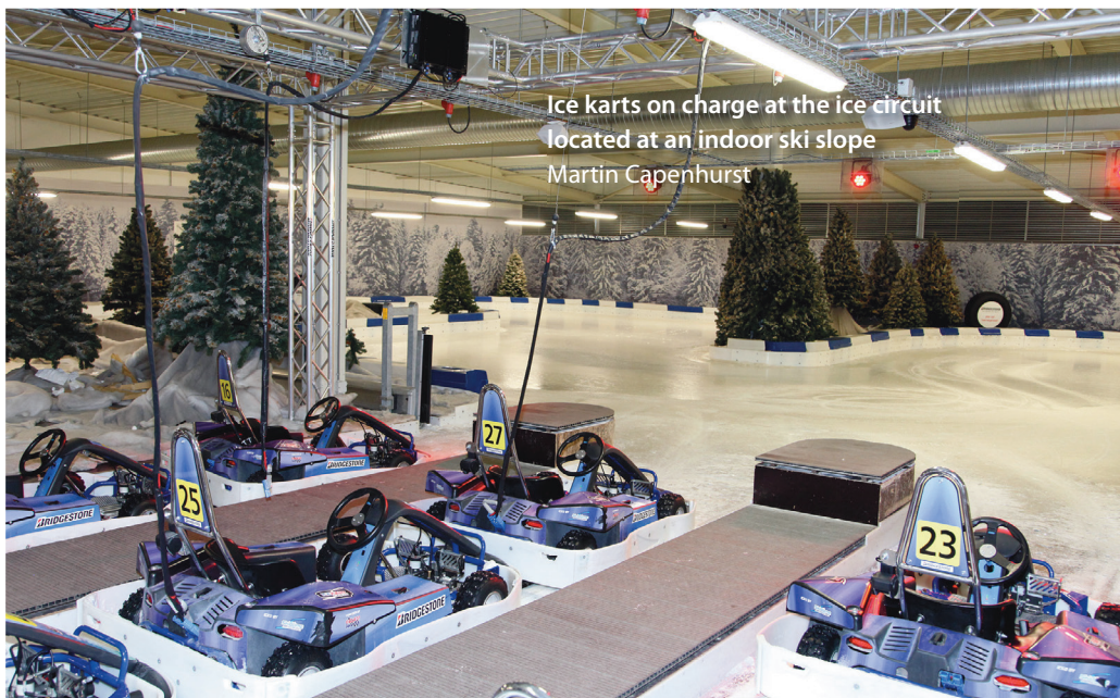
Ice karts on charge at the ice circuit located at an indoor ski slope

Electric Kart Company www.ekc-karts.com . ●