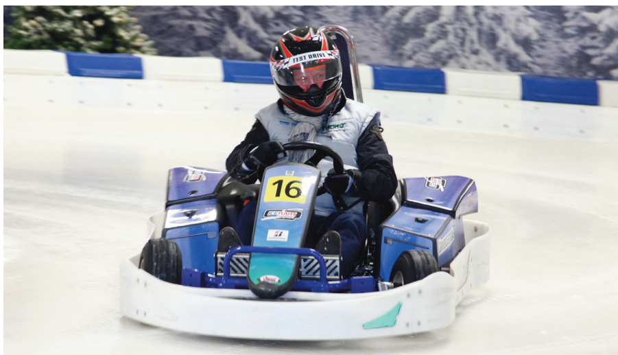
The ice karts were great fun to drive